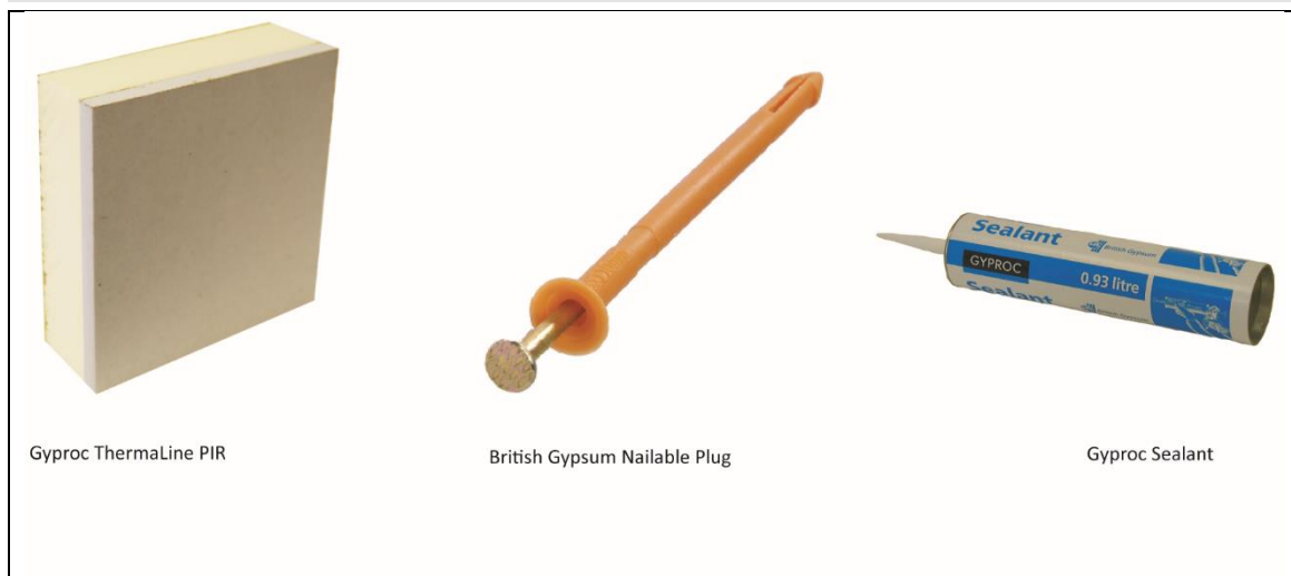
Figure 1 DriLyner DAB (Sealant Variant) — system components

1.3 The boards are available with the nominal characteristics shown in Table 1.